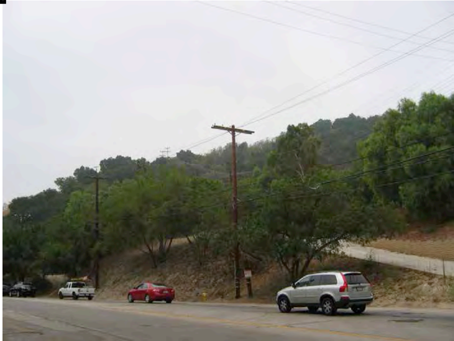
Figure 3.1-7 View of Development Site, Looking Southwest from Harvard- Westlake Driveway (location 5 on map)