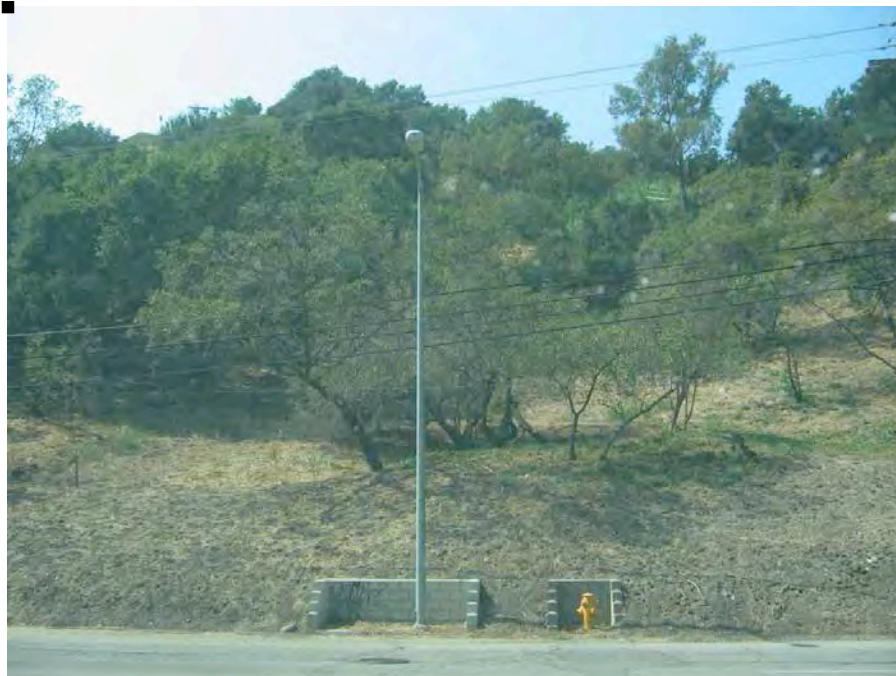
Figure 3.1-4 View of Development Site, Looking West Across Coldwater Canyon Avenue (location 2 on map)