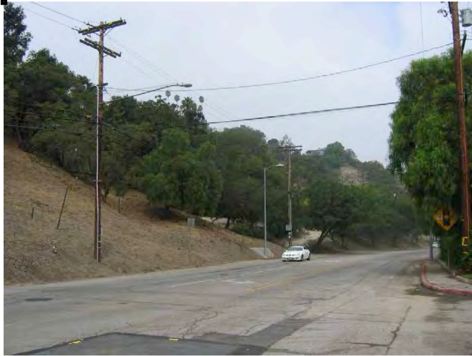
Figure 3.1-3 View of Development Site, Looking Northwest from Coldwater Canyon Avenue at Hacienda Drive (location 1 on map)