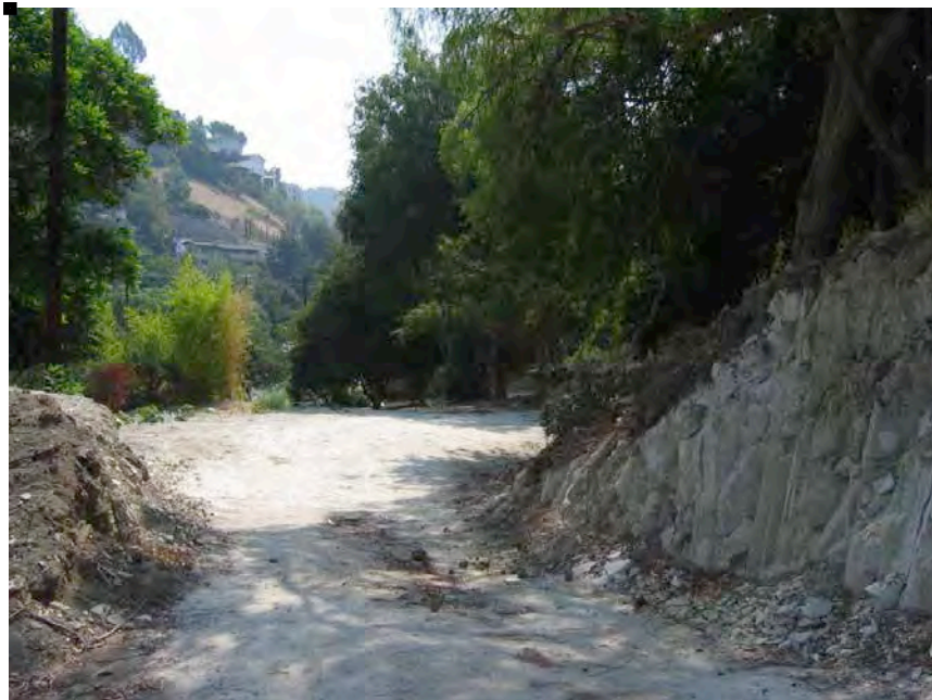
Figure 3.1-8 View of Middle portion of Development Site, Looking South (location 6 on map)